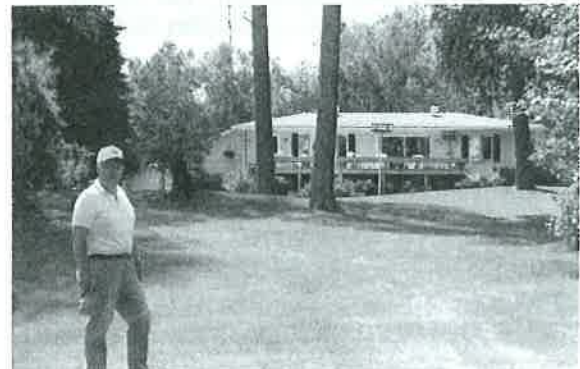
TURTLES ONLY HAVE ABOUT 200 FEET TO CRAWL