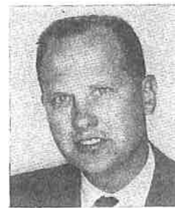
Deputy Commissioner, Division of Adult Corrections

In spite of my inexperience, I found myself enjoying the assignment and I guess it was a stepping stone for my eventual career in the Minnesota Prison System.