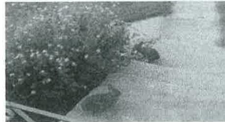
FRIENDLY RABBITS AT THE DOOR